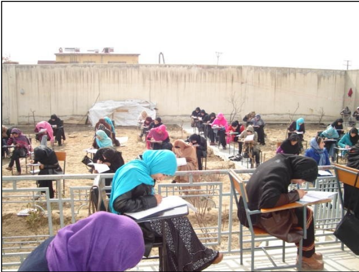
Selected students taking a pre-test at Oruj Learning Center, Kabul

In partnership with Kabul's Oruj Learning Center, Sadiqa Basiri established the Youth Capacity Building Initiative — a 12 month program for 100 Afghan girls from 11 th and 12 th grades. The program gives extra help to those students with gaps in learning resulting from the Taliban holding them back. They learn science, computer basics, English, and leadership skills; thus increasing their abilities to qualify for college scholarships and to secure employment. Some of Sadiqa's award paid for teachers' salaries and some for fuel to power generators needed for computers. Also required was transportation to school and Sadiqa worked a plan to make that happen. She expects the project to continue and will be engaging current students to help develop strategies to sustain the project.