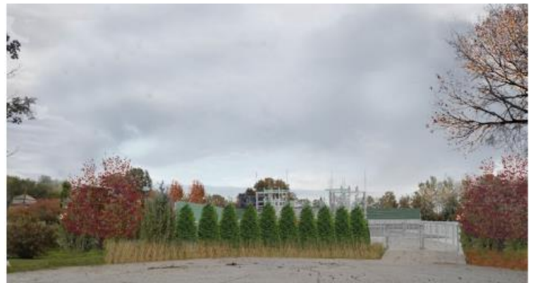
FOR ILLUSTRATION: Boulevard 77 Substation Landscape Rendering – view from west, driveway

Sincerely, Matt Watkins, Consultant National Grid, Project Engagement