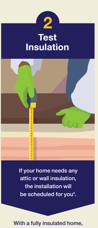
With a fully insulated home, you could save up to 15% on your energy bill every year.