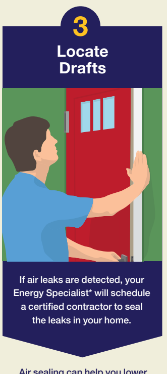
Air sealing can help you lower your heating/cooling bill by up to 15%.