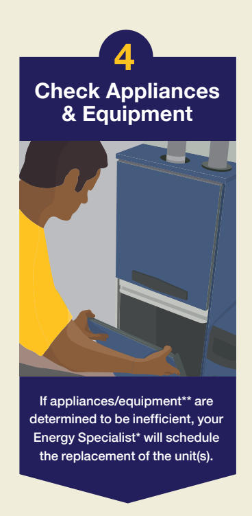
A new heating system and efficient appliances will reduce maintenance and improve comfort in your home.