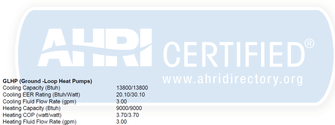
Figure 4: Geothermal AHRI Certificate

If equipment is being installed in non-standard temperatures, option B should be followed to calculate sizing ratio. The participating contractor will be required to submit manufacturer performance data at the specific design conditions. The AHRI method will apply in most circumstances.